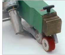
Automated hot air welding helps maximize installation efficiency.

The Flex Metal Roof Retrofit System is typically installed as a hot- or cold-applied adhered system, but can also be mechanically attached. The Flex Roof Membrane is a modified thermoplastic PVC material, incorporating DuPont Evaloy®